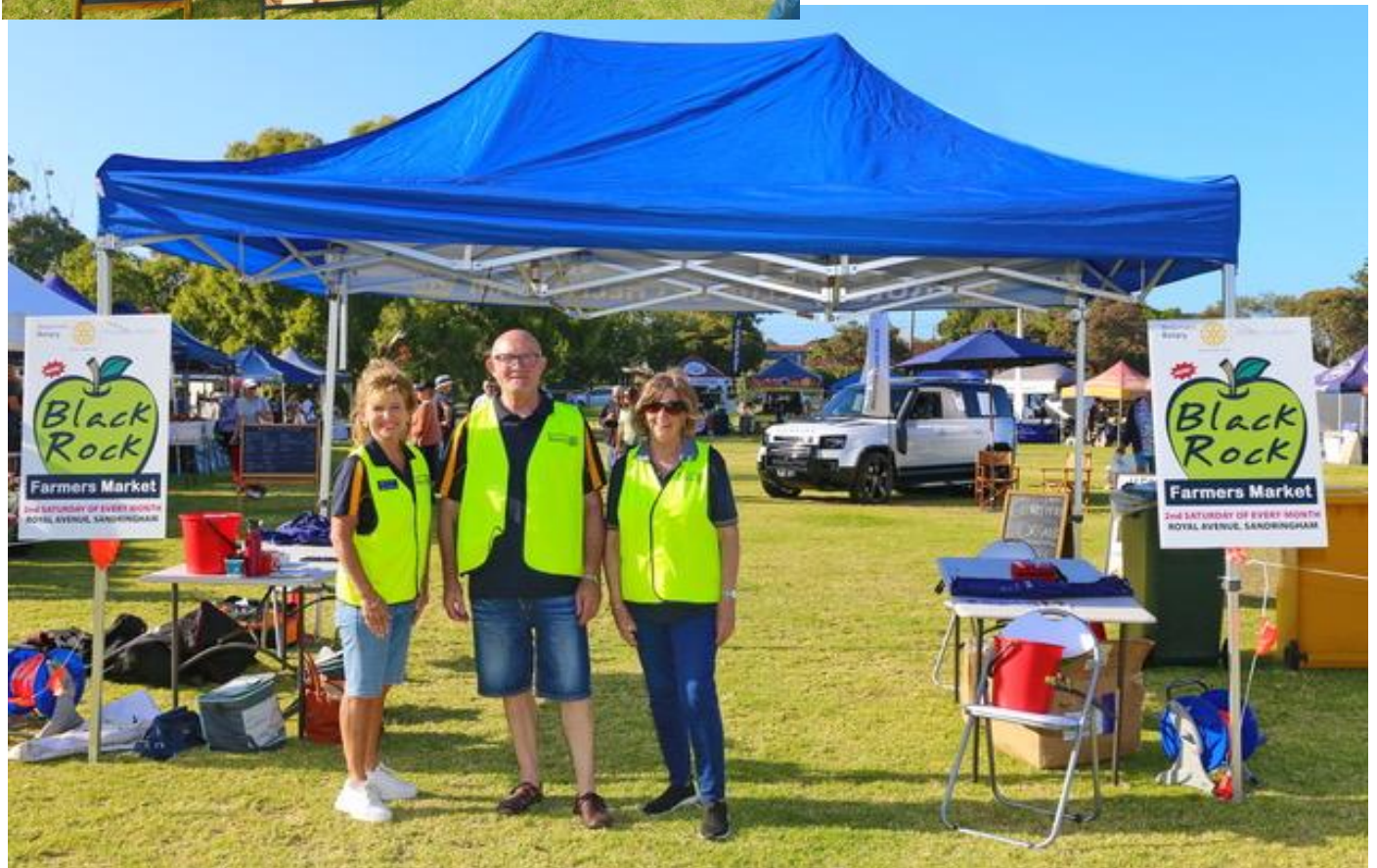
Left /Below: Farmers Market