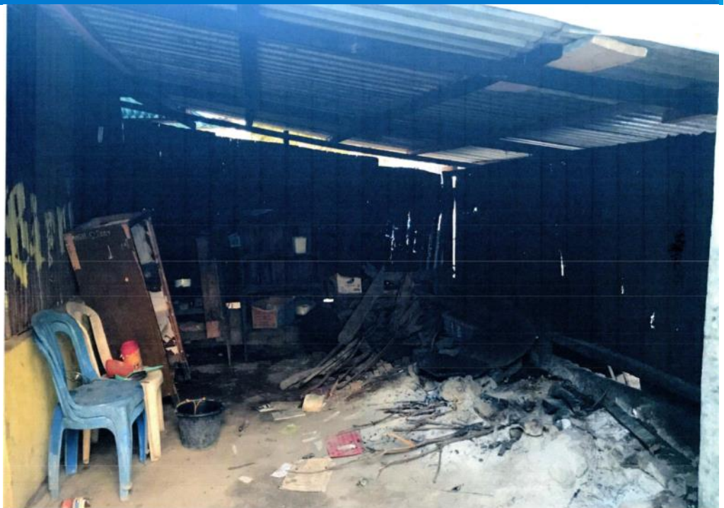
Current kitchen in Mebba, Seba