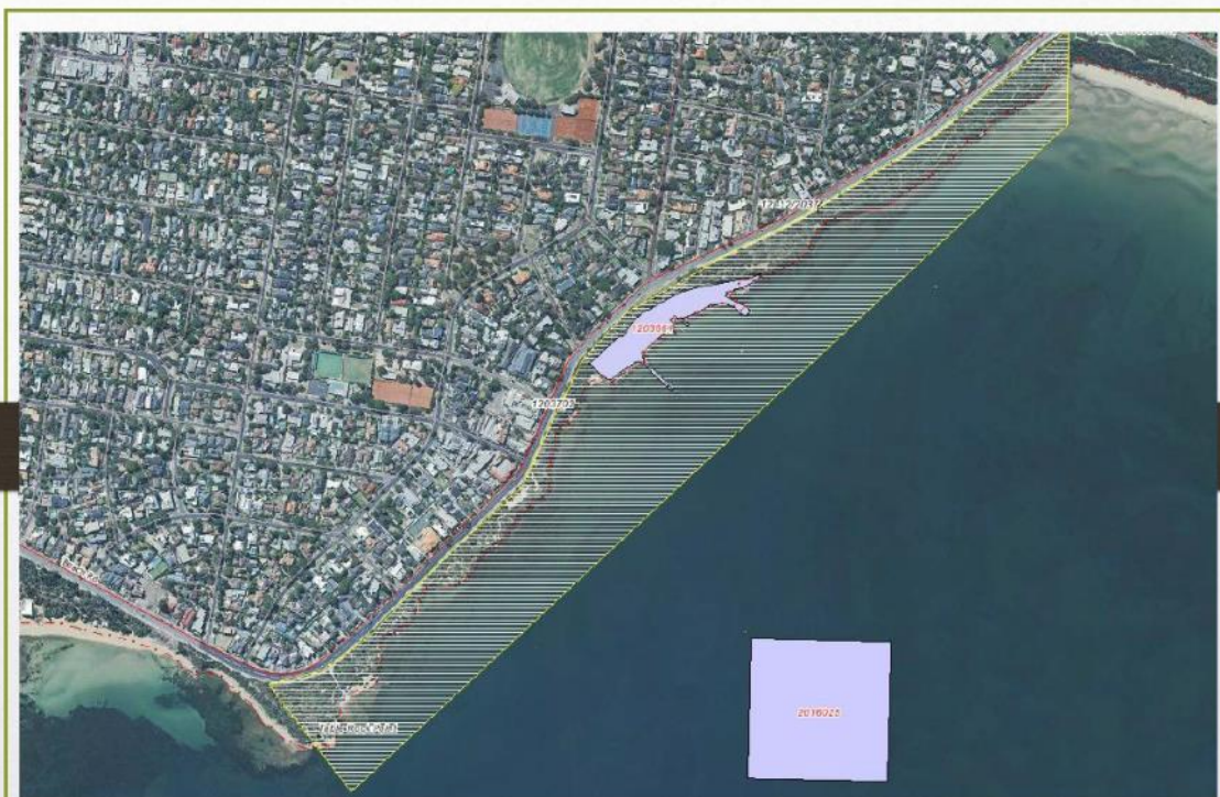
Beaumaris Bay Site A fossil site

In 2016, the Federal Heritage Department described the Beaumaris Bay fossil site as being of high quality, very comprehensive, well documented, well presented, and included substantial additional information and letters of support from local community interests and fossil specialists.