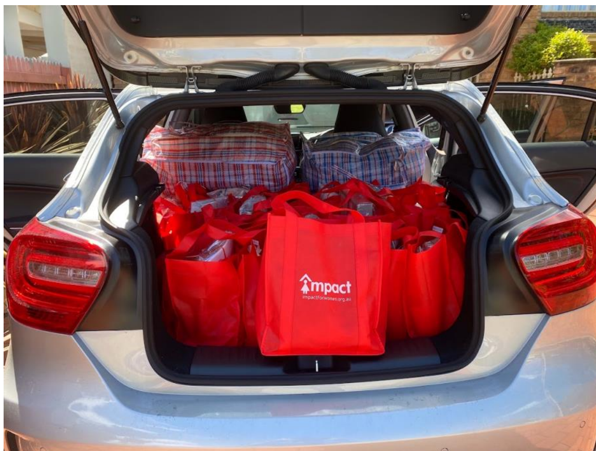
Below: Impact's Bags of Love loaded into a Beaumaris Rotary member's car ready for delivery to one of their client organisations in the Melbourne area.