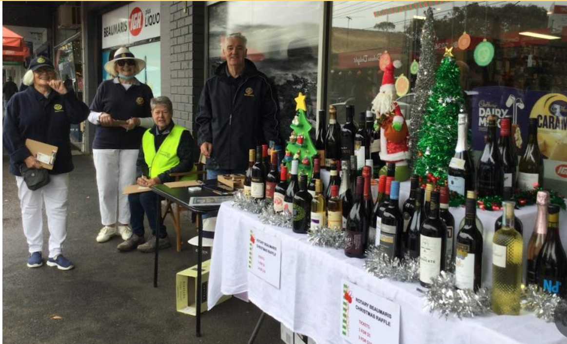
Our ace team of Christmas raffle sellers at the Beaumaris Concourse.