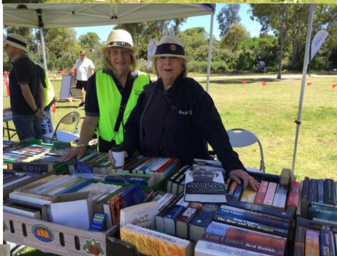
Above Farmers Market